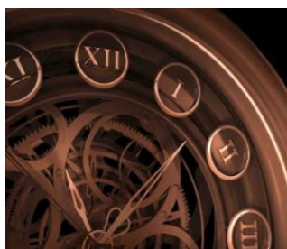
RENDICONTI, VOLUME 10...